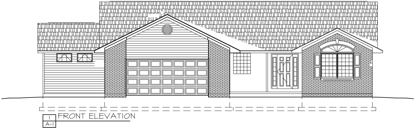
FRONT ELEVATION A-1